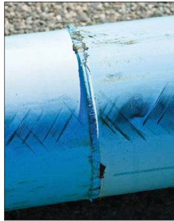
A finished fused joint between two sections of fusible PVC pipe.

The distribution and collection division and the City of Billings couldn’t be happier with their program. By purchasing the equipment and investing in staff training, the division is saving