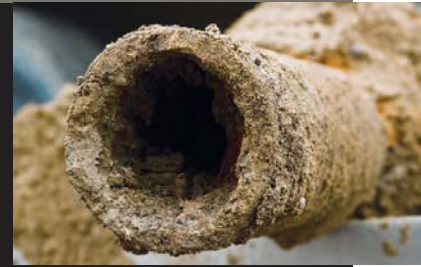
A section of old 4-inch cast iron pipe installed in 1916.

Lustig says regular valve and hydrant inspections and customer concerns are other ways of finding leaks. “Sometimes we have homeowners call and say they can hear running water,” he explains. “That’s a pretty good indication that there’s a leak somewhere nearby.”