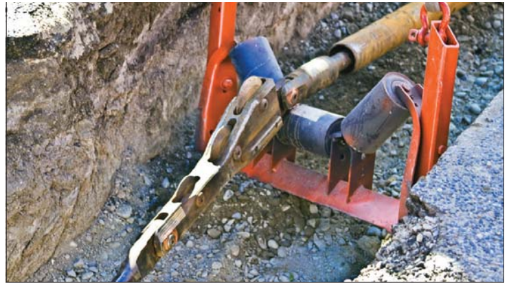
The slitter section of the pipe bursting system.

Scott Haynes (left) and Ryan Skillstad work with the fusion machine as part of the fusible PVC pipe replacement system offered by Underground Solutions.