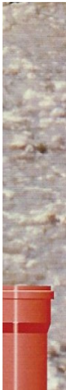
DN 250 pipe (according to EN standards)

Energy consumption in production is important as it generally relates directly to carbon dioxide emissions (greenhouse gas). A published study (Chem Systems) compared carbon dioxide emissions per km of PVC and Steel water pipe and found that the manufacturing of Steel pipe created almost four times the carbon dioxide emissions as PVC pipe. When compared to HDPE (High Density Polyethylene) material, PVC manufacturing results in 27% less carbon emissions than HDPE.